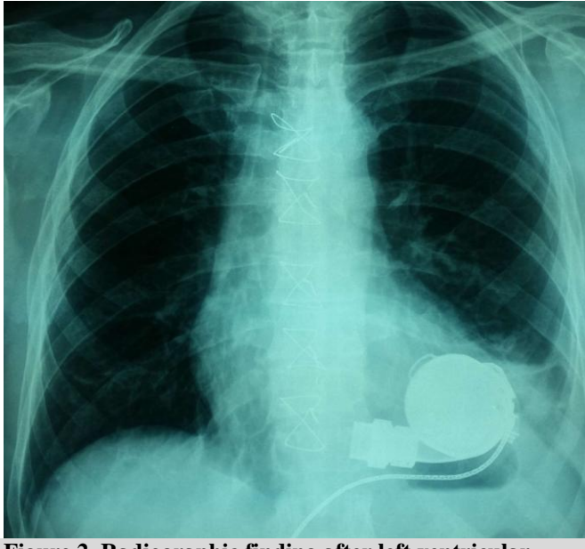
Figure 2. Radiographic finding after left ventricular assist system, HeartMate 3 implantation.

pump speed was set at 4900 rpm, with pump flow 3.4 l/min and pump power 3.2w. There were stable LVAS parameters and data on the pump controller. Radiographic finding was regular (Figure 2). Postoperative hemodynamic data showed PCWP 10 mmHg, CVP 7 mmHg, CI 3.2 l/min/m<sup>2</sup>.