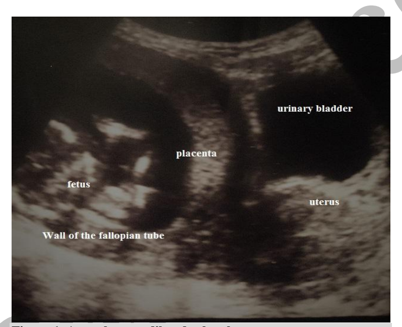
Figure 1. An embryo, a dilated tube, the uterus – transverse imaging.

On admission to our Clinic the patient was conscious, afebrile, normotensive, and painless, with scarce vaginal bleeding and she was cardiocirculatory stable. The abdomen was insensitive to superficial and deep palpation. Speculum examination revealed cylindrical cervix, transversal orifice, moderate bleeding from external orifice, and dark blood. Proust pain sign was negative. On bimanual examination the uterus was enlarged and softened, slightly shifted to the left in retroversioflexion (RVF). The left adnexal region was palpable without tumefactions. In the right adnexal region and below the uterus, a soft, tense and insensitive formation about 10 cm in diameter was palpated. Transabdominal ultrasonography examination (Toshiba Nemio, XG, 6 MHz) with the bladder not full enough revealed the presence of the gestational sac with developing anterior wall placenta and the fetus without heart action and with positive Spalding's sign (overlapping of skull bones) (Figure 1).