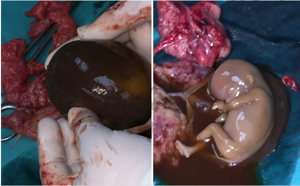
Figure 3. Cut tubal wall and peeled gestational sac. Figure 4. An embryo, placenta, cut tubal wall.

drain was placed in the pouch of Douglas pararectally. The abdomen was then closed in layers. The sample was carefully cut, so all the structures and the embryo described by the ultrasound were observed (Figures 3, 4). After closing the abdomen, the patient was placed in lithotomic position and instrumental revision of the uterine cavity was performed because of heavy vaginal bleeding during the surgical procedure. An abundant specimen was obtained. Both the removed adnexa and the specimen were subjected to a histopathological examination. The surgical procedure lasted 50 min. The postoperative course was normal. The control drain in the pouch of Douglas was removed on the third postoperative day. The patient was discharged on the fifth postoperative day with fully restored passage and normally healing wound. Postoperative ultrasound finding was normal. On the second postoperative day the patient was given Immunorh. No I immunoprophylaxis.