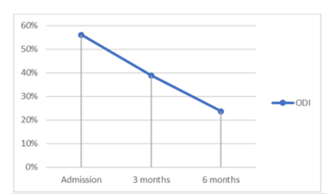
Figure 3. Values of ODI score change over 6 months after the surgery.

b – United Kingdom; c – USA; d – China; e – Australia [6].