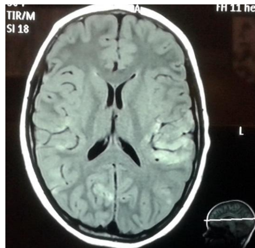
Figure 2. Axial MRI showed multiple inflammatory and ischemic changes in brain tissue.

secretion from the left ear. Streptococcus pneumoniae was detected in swab taken from the left ear. Due to the appearance of convulsions, Phenobarbital and Midazolam were introduced into therapy. Electroencephalography showed signs of severe encephalopathy. Cerebral MRI with angiography showed meningitis and disseminated multiple inflammatory and ischemic changes in brain tissue. Cranial venous sinuses had a normal caliber and blood flow, with no signs of thrombosis (Figure 2).