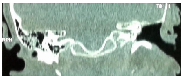
Figure 3. Coronal CT scan after radical tympanomastoidectomy showed normal findings.

to walk independently, sphincter control was normal, he understood orders, but aphasia was present. Due to the inability of oral feeding, the patient was discharged with nasogastric tube that is well tolerated. Finally, the immunological tests performed during hospitalization showed that the patient was immunocompetent.