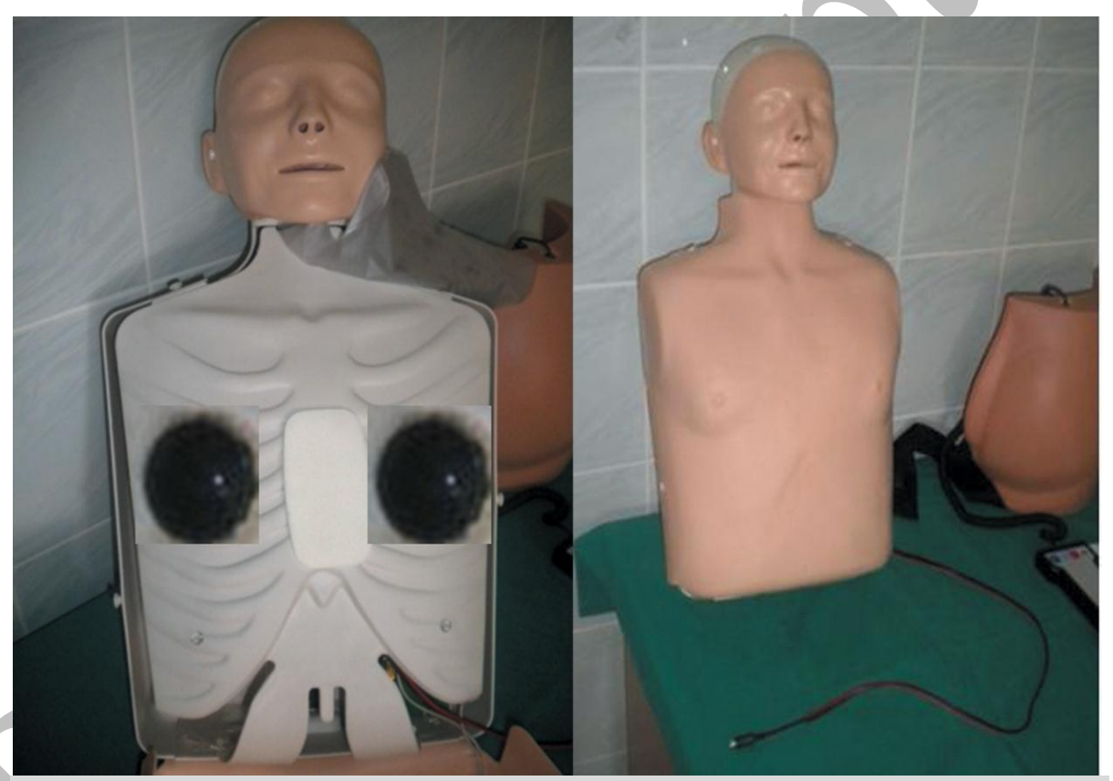
Figure 3. Speakers installed in manikin's torso connected to computers in command room to emit heart sounds and murmurs, and lung sounds.

One of our "inventions" is the installation of audio equipment into the torsos of static manikins, which is then connected to software in the command room, allowing students a more realistic approach to studying the auscultation of heart sounds and murmurs and lung sounds (Figure 3) [21,22].