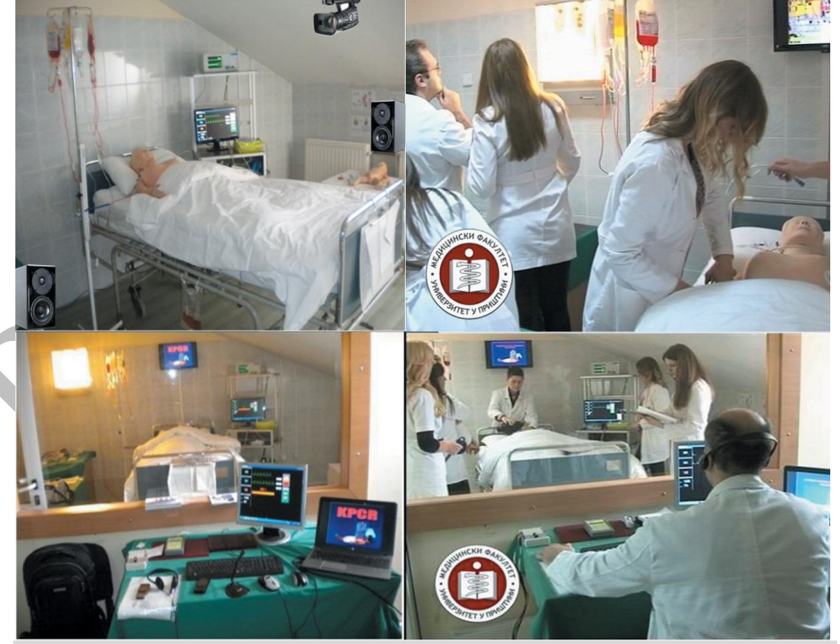
Figure 2. Actual view of our Simulation Center and work done in it.