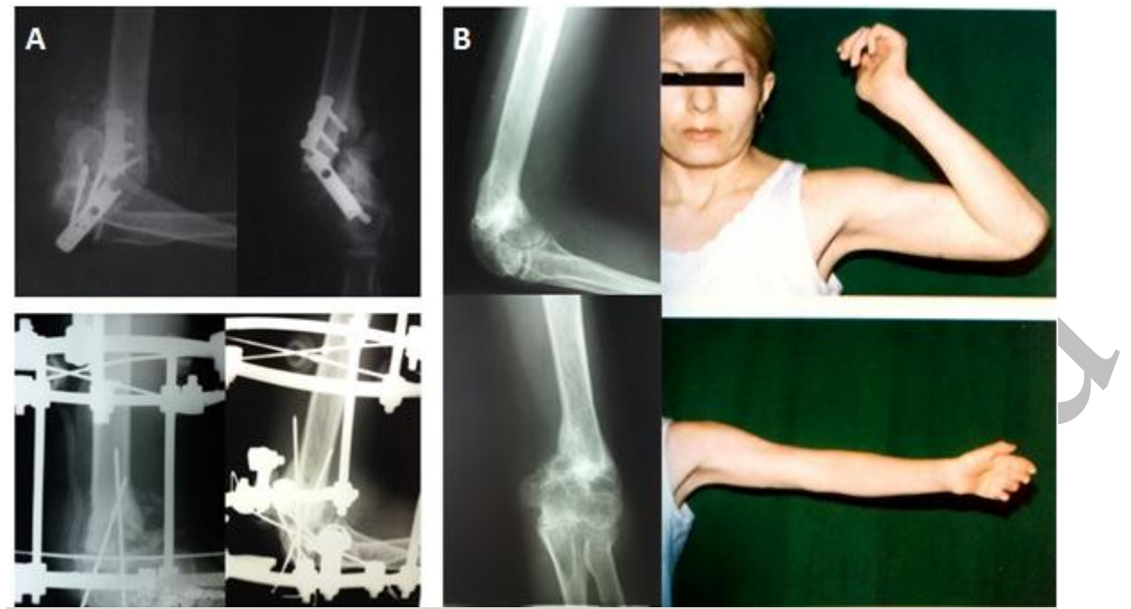
Figure 2. (A) Radiographs of 33 years old female treated with Ilizarov method eight months after failed initial osteosynthesis. (B) Radiographs and clinical photographs after application of Ilizarov fixator for nine months, showing complete union with elbow motion restoration.

treated conservatively with complete recovery after two mounts. All postoperative parameters are shown in table 2.