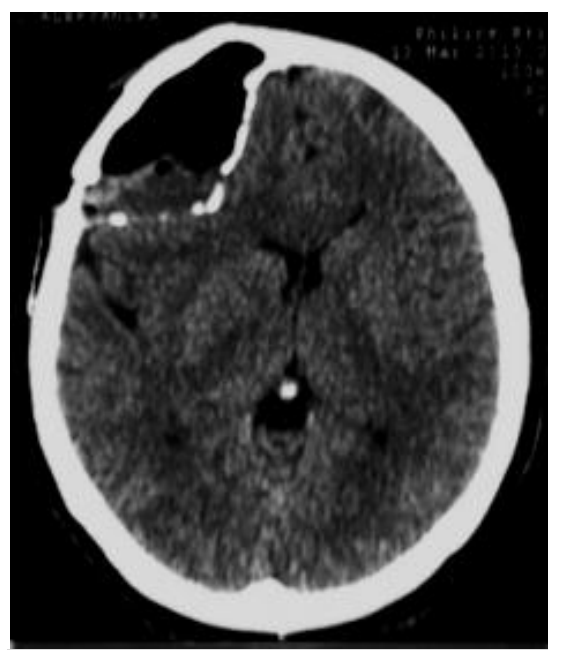
Figure 3. MR image after six months of cranioplasty showing no reccurence of dermoid cyst.

The patient was then referred to our maxillofacial unit for treatment. We performed a second operation together with maxillofacial specialist. We did reconstruction of bone deficit with cranioplasty and reconstruction of frontal sinus (Figure 3).