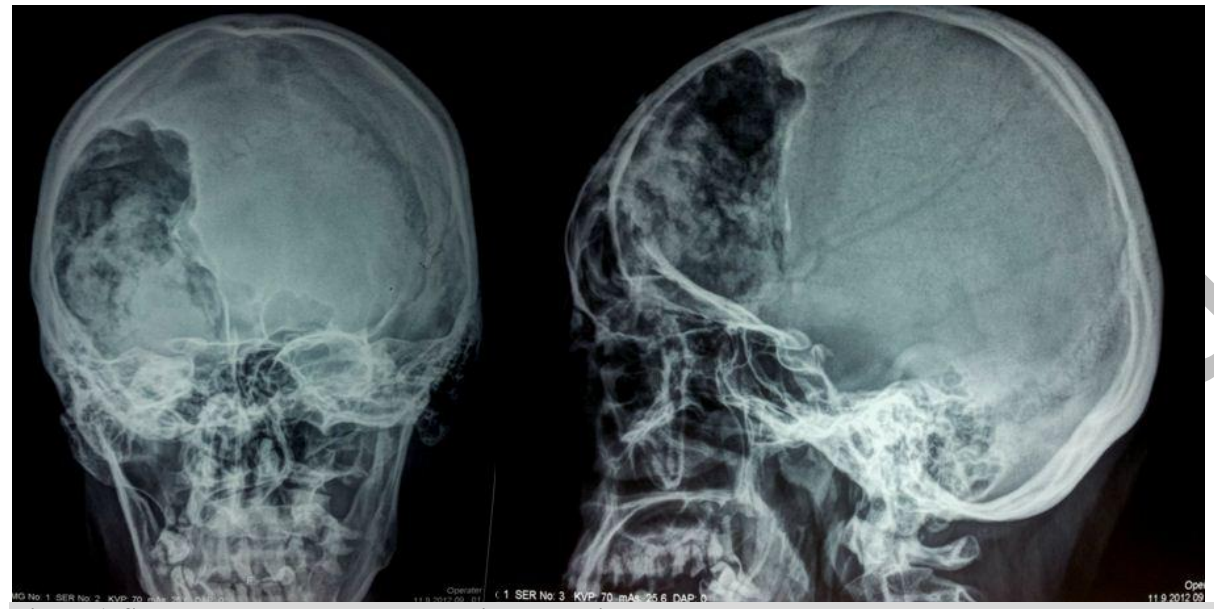
Figure 1. Scull X-ray show extradural lytic bone lesion.

examination was needed because the present finding showed clearly extracerebral mass with frontal bone erosion.