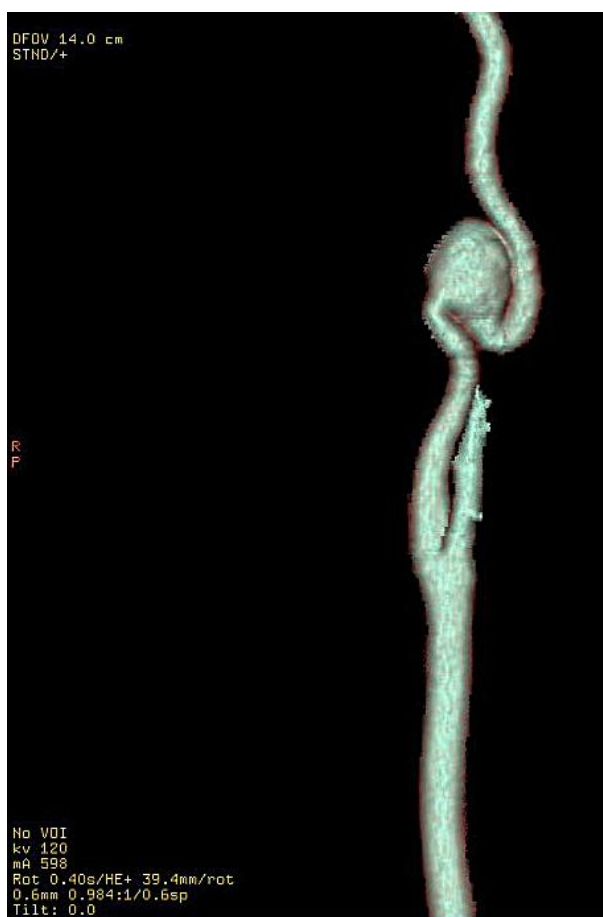
Figure 1. MSCT angiography. Right ICA aneurysm associated with medial kinking.

On admission routine echocardiography showed an aneurysm of the atrial septum and a potentially patent foramen ovale. Subsequent transesophageal echocardiography confirmed the presence of the aneurysm, but the presence of shunt between the atria was excluded.