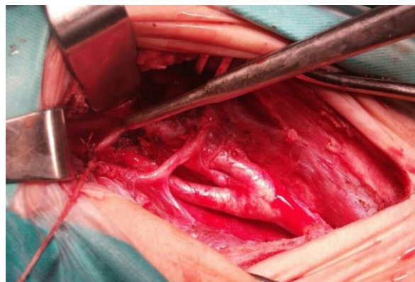
Figure 3. Intraoperative findings. Right ICA reconstructed by end-to-end anastomosis.