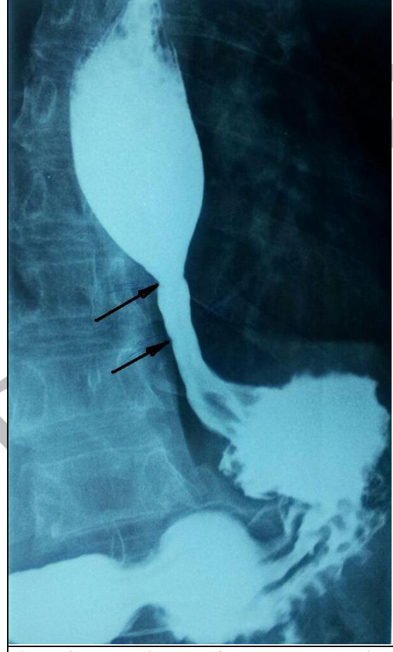
Figure 3. X-ray pictures of the oesophagus with barium contrast. Oesophageal stenosis as the only consequence of the PTLD.