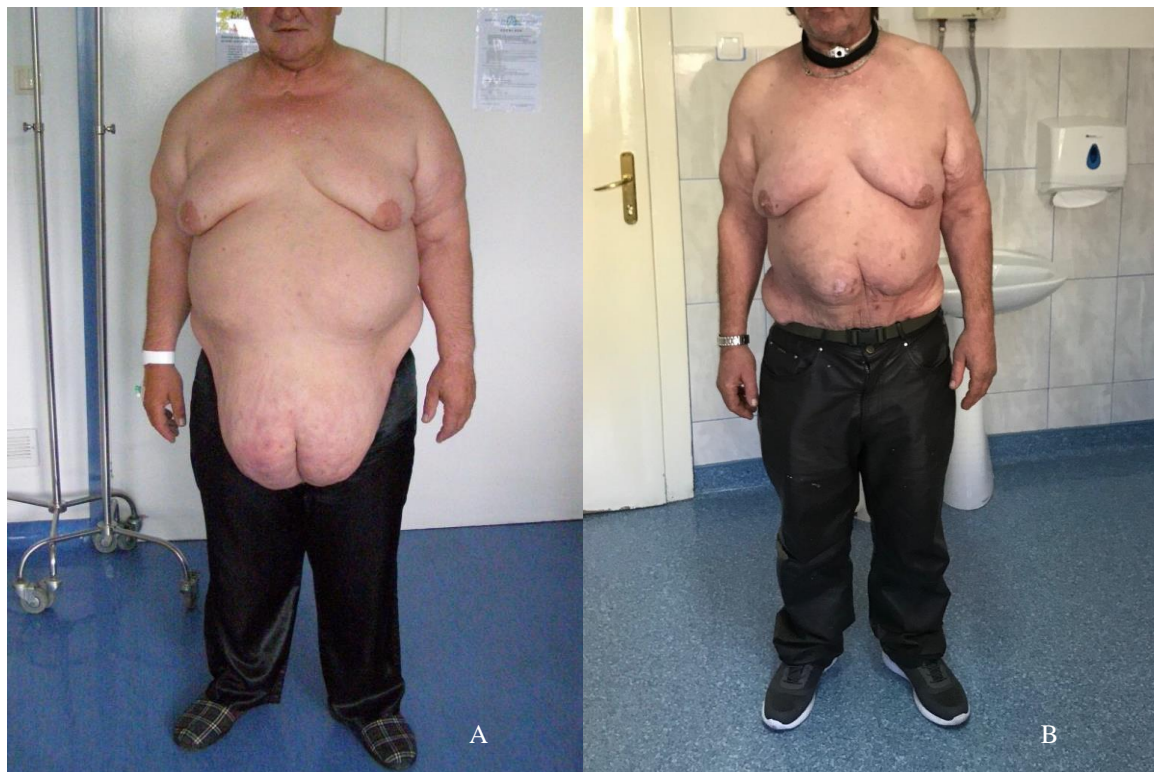
Figure 1. A super obese 54-year-old patient before the operation (A) and one year later (B)