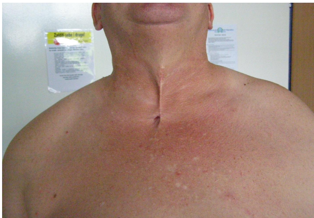
Figure 2. The scar from the previous tracheal operation