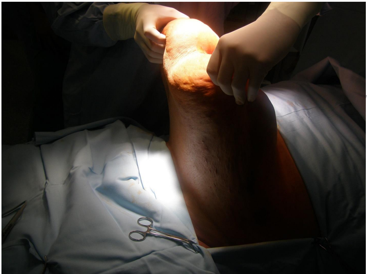
Figure 4. Preparation for panniculectomy