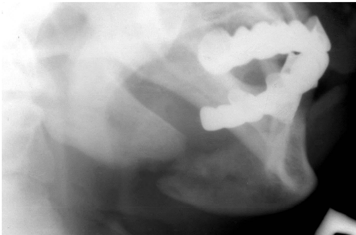
Figure 3. Pseudarthrosis of the atrophic type in the angle of the mandible