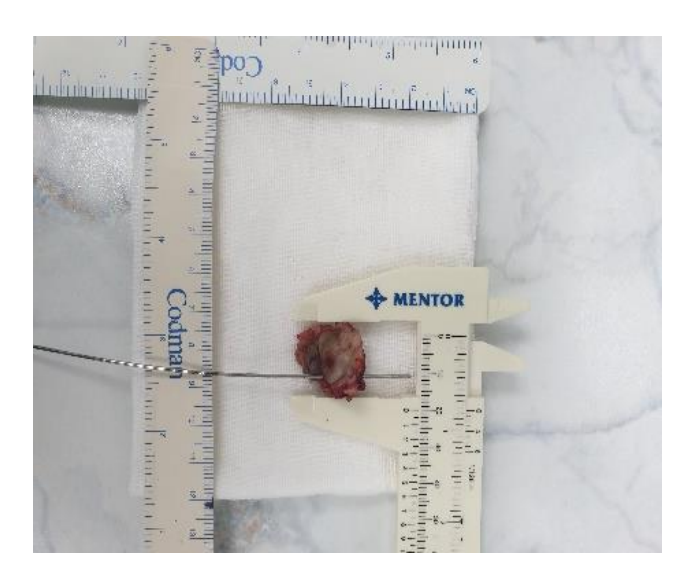
Figure 3. Resected abdominal wall with cutaneous fistula