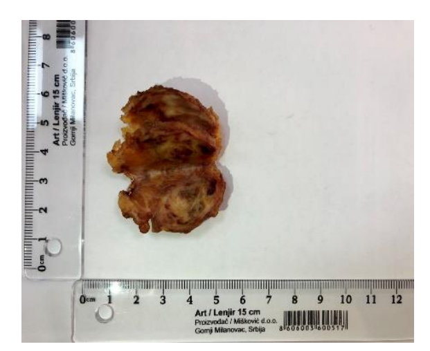
Figure 2. Anterior abdominal wall fragment with the zones of hemorrhage and fibrosis