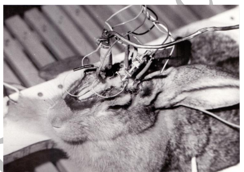
Figure 3. The figure shows simultaneous registration of EEG activity and activity of single neurons using microelectrodes implanted in deep subcortical brain structures on experimental animal (rabbit) [8].

and light stimulation. She registered EEG and neuronal – single unit activity during electro-cutaneous and light stimulation [8]. Registered changes in neuronal activity of nc. caudatus and sensorimotor cortex in act of alimentary behaviour have indicated that examined structures participate in the realization of coordinated motor activity, learning and emotional states related to alimentation as dominating motivation. It was also found that specific components of studied structures were involved in certain stages of registered forms of behaviour (Figure 3) [9,10].