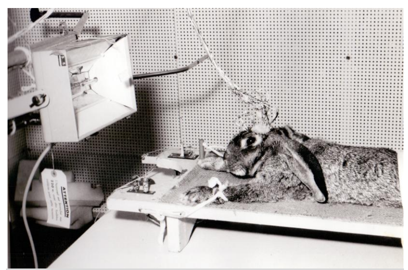
Figure 2. Representation of experimental environments during making of one of the doctoral dissertations in the Laboratory [7].

Moscow and finishing them in Novi Sad. He examined the structure of functional systems that are the basis for orienting response [7]. He defended his doctoral dissertation in 1979.