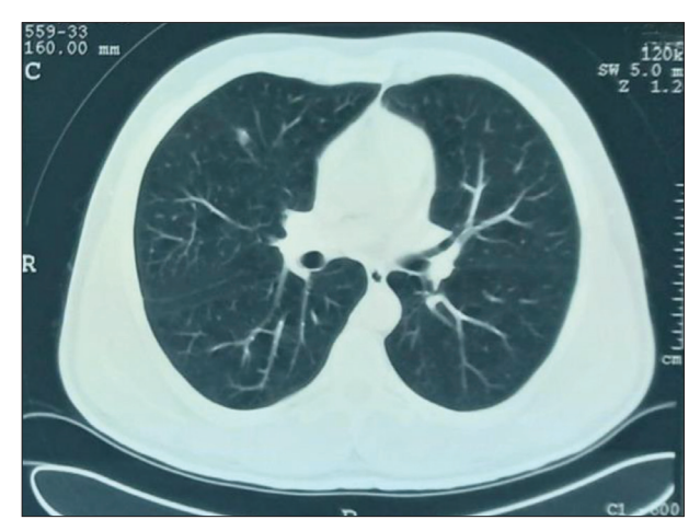
Figure 2. Computed tomography scan of the lung showing parenchymal nodule

was within the range of low disease activity. In July 2020, the patient had COVID-19 pneumonia presented with mild symptoms. Three months after this viral infection, he suffered from arthritis flare up (DAS28 – 5.74). Regarding the loss of efficiency of combination therapy with Methotrexate and glucocorticosteroid, an inhibitor of Janus kinase (JAK) – baricitinib was added in a daily dose of 4 mg in August 2021. Low disease activity was achieved after three months (DAS28 – 2.18). During the most recent visit, the patient did not have any signs of active synovitis and inflammatory markers were in the reference range (DAS28 – 2.52). Additionally, no adverse events were reported during a 20-month period of baricitinib administration.