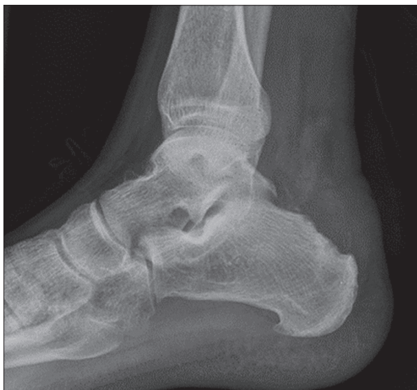
Figure 3. Initial postoperative X-ray of the heel bone