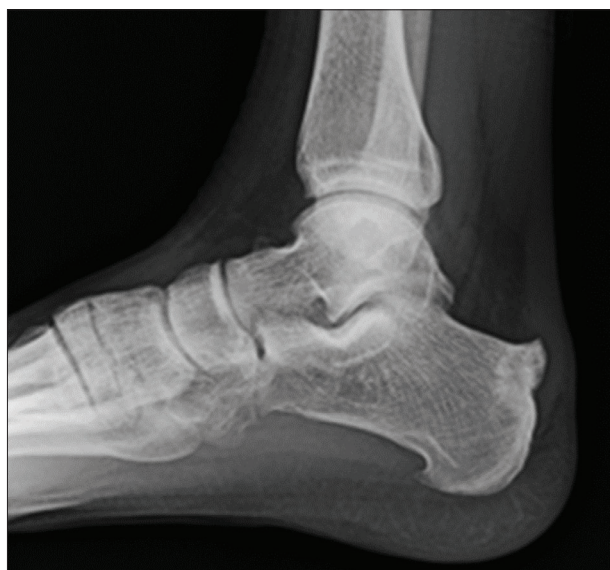
Figure 1. X-ray of Haglund's bone deformity

six men and four women of an average age of 37 years (25–66 years). All patients had suffered from the condition for more than 12 months (12–26 months) and had been treated by non-surgical methods before.