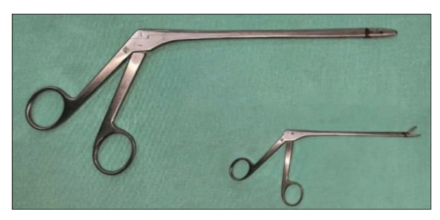
Figure 3. Red line at the tip of the mouth of the straight and reverse-angled rongeur device

in the bladder bag, the drainage fluid was analyzed and confirmed to be urine.