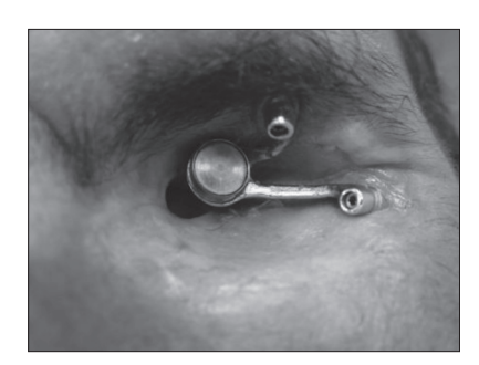
Figure 4. Patient in remission after hyperbaric and conservative therapy