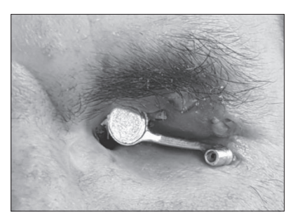
Figure 6. Prothesis substructure remodeled for one implant retention

The report has been reviewed and approved by the Ethics Committee of the School of Dental Medicine, University of Belgrade (No. 36/14).