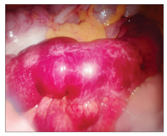
Figure 1. Intraoperative view of the segment of the small intestine that was in the hernial sac

In the case of our patient, a segment of the small intestine was incarcerated, which was found within the hernia sac.