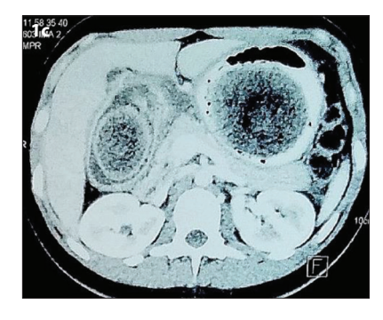
Figure 1c. Abdominal computed tomography – axial sections that shows a trichobezoar as intraluminal mass in stomach and tail in duodenum