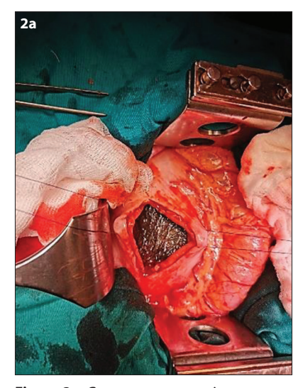
Figure 2a. Gastrotomy, a massive compact foreign body completely occupies the lumen of the stomach

Figure 1c. Abdominal computed tomography – axial sections that shows a trichobezoar as intraluminal mass in stomach and tail in duodenum