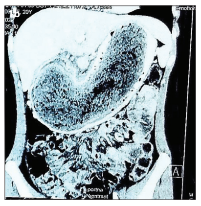
Figure 1b. Abdominal computed tomography scan – coronal section shows a trichobezoar as a non-enhancing intraluminal mass with trapped air bubbles in the interstices which is distending the stomach