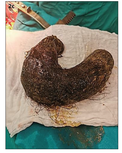
Figure 2c. Trichobezoar forming a cast of the stomach