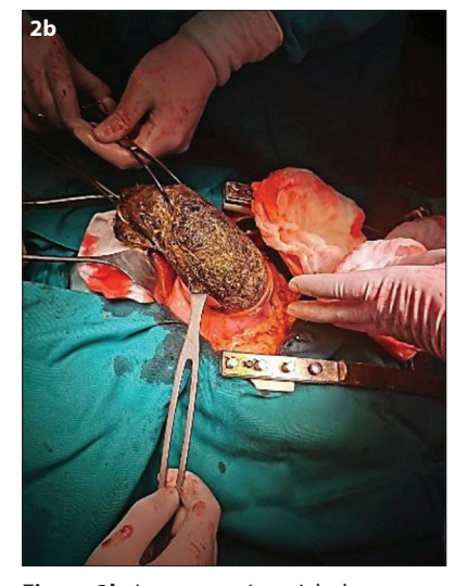
Figure 2b. Intraoperative trichobezoar extraction following a gastrotomy