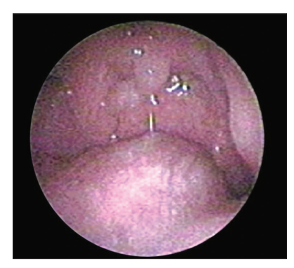
Figure 1. The endoscopic image of the thyroglossal duct cyst

cyst-like characteristics in the laryngopharynx. Above, it communicated with the foramen cecum at the basis of the tongue and distally extended towards the hyoid bone, with a demarcated thyroglossal duct (Figure 2a). An ectopic thyroid tissue was excluded on diagnostic imaging (ultrasonography, MRI), and the presence of a properly developed thyroid gland in its anatomic position was confirmed. A provisional diagnosis of a lingual TDC was made, and the patient was referred for operative