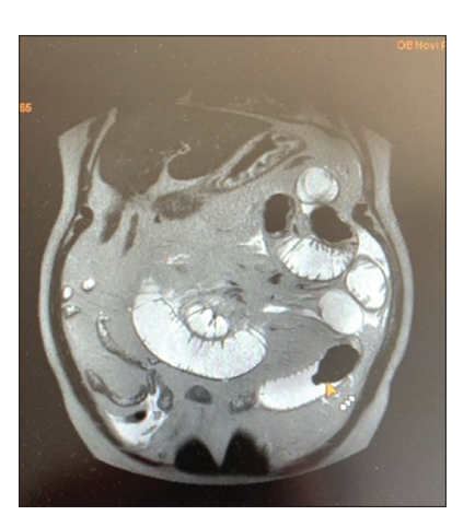
Figure 3. Magnetic resonance imaging – gall-stone in the ileum