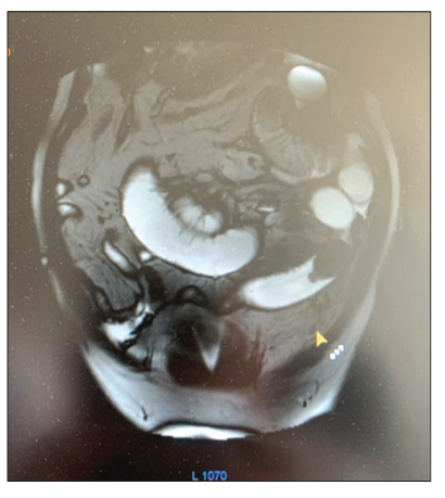
Figure 2. Magnetic resonance imaging – gall-stone in the ileum