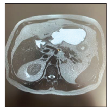
Figure 4. Magnetic resonance imaging – collapsed gallbladder