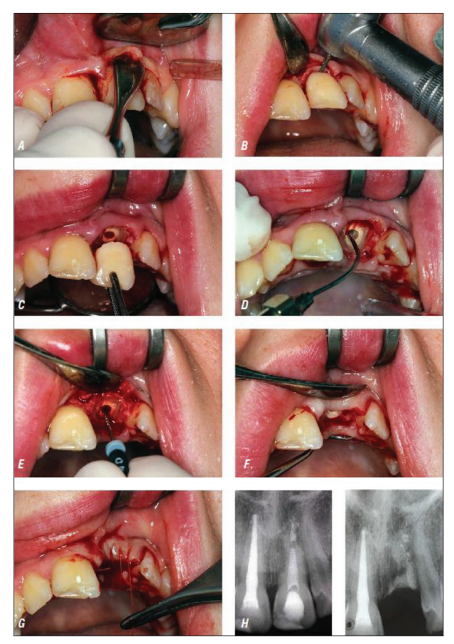
Figure 1. Decoronation of ankylosed and infrapositioned upper left central incisor in a 9.5-year-old boy; A – following administration of local anesthesia, a full-thickness buccal mucoperiostal flap is elevated; the palatal tissue is left intact; B – The crown of the ankylozed incisor is cut with a diamond bur 1–2 mm below the alveolar bone crest under continuous saline irrigation; C – the dental crown is removed; D – from the root canal, calcium hydroxide is washed out (Calxyl, O OCO Präparate GmbH, Dirmstein, Germany); E – the root canal is endodontically instrumented and copiously rinsed with saline; F – As bleeding filled the empty root canal; G – the mucoperiosteal flap is repositioned and sutured; H – on x-rays taken two months after the dental trauma (the incisor was reimplanted 1.5 hours after avulzion); I – after decoronation

tenderness on palpation and was pathologically mobile. X-ray taken at this visit displayed inflammatory and replacement resorption of the right and left incisor, respectively. Therefore, we started root canal treatment of both non-vital teeth.