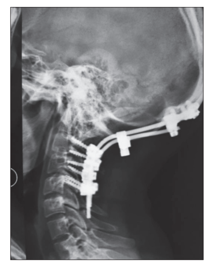
Figure 4. Postoperative X-ray

Follow up nuclear MRI was performed (Figure 2) following the first hospitalization and the findings were unchanged and the neurosurgical procedure (suboccipital craniectomy and decompression) was performed. Approximately one-year post-op the patient presents with following symptoms: headache, left arm paresthesia eventually followed by left side hemiparesis. New multislice computed tomography and MRI scans were obtained and showed progression of syringomyelia expanding cranially to syringobulbia, decompression in posterior cranial fossa was still intact. Two months later the symptoms persisted and new MRI scans were obtained - in comparison with former scans progression of hydrosyringomyelia was observed, as well as expanded central medullar canal with oedema. Conservative treatment was tried with antiedema therapy, but there was no clinical improvement. The patient was hospitalized again and another MRI evaluation was performed, and neurosurgeon and orthopedic spinal surgeon indicated OC stabilization.