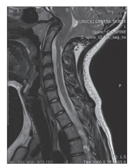
Figure 2. The first follow up magnetic resonance imaging, before the first surgery