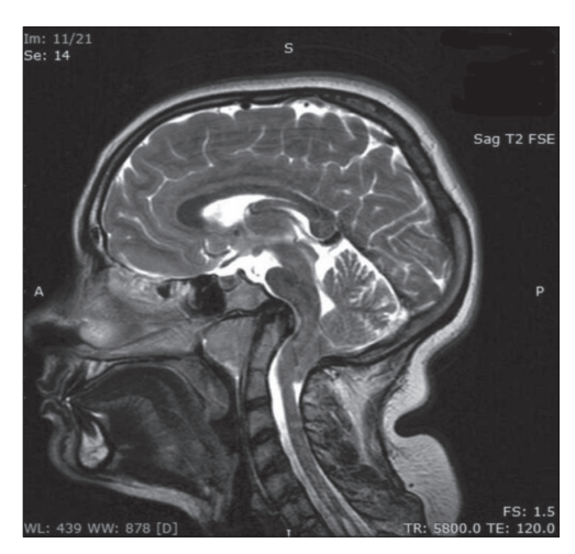
Figure 1. The first magnetic resonance imaging showing herniation of cerebellar tonsils through the foramen magnum (20 mm) with spinal cord compression

for a few minutes and disappeared spontaneously. They first appeared six months prior to hospital admission. After careful examination she was diagnosed with Chiari malformation type I that was magnetic resonance (MRI) verified – a prolapse (herniation) of the cerebellar tonsils through the foramen magnum by 20 mm, with compression of the spinal cord. The ventricular system was in an orderly position and shape, without signs of hydrocephalus. In addition to this obvious malformation, the existence of syringomyelia (starting from C5 and caudally) and malformation of the base of the skull in terms of platybasia and an abnormal angle between the medulla oblongata and mesencephalon were observed (Figure 1).