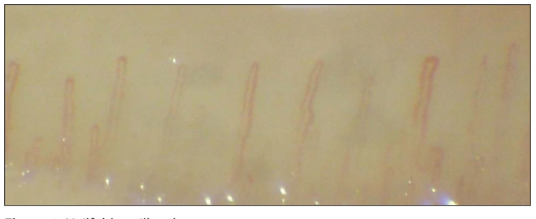
Figure 3. Nailfold capillary loops