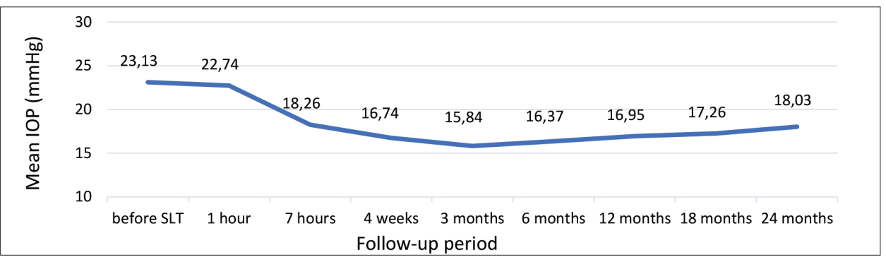
Figure 1. Mean intraocular pressure (IOP) values during the follow-up of 24 months