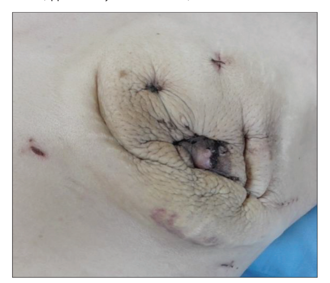
Figure 3. Clinical findings after the surgery and removing the drains; stitches on the sites from excided fistulous canals; two incisions on the border of the breast and abdominal skin are from drains; vital skin flap, after performing nipple spearing mastectomy with nipple areola complex preservation

were negative on bacteria and fungi. The patient was initially offered Prednisone and Methotrexate therapy, with the presentation of all possible positive and negative effects of the proposed therapy, which she refused and accepted only surgical treatment.