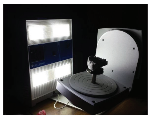
Figure 1. Scanning of a study model positioned on a stand with NextEngine 3D scanner HD (Next Engine Inc., Santa Monica, CA, USA)

Alginate impressions were taken for patients in both groups. Plaster models were poured on the same day and study models were trimmed. Each study model was positioned on a stand and scanned by a single operator (MZ) using the NextEngine 3D scanner HD (Next Engine Inc., Santa Monica, CA, USA; Figure 1). Digitized study models were saved as stereolithography (.stl) files and imported into the Geomagic Control software (Raindrop