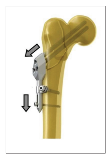
Figure 3. Self-dynamizing internal fixator according to Mitković