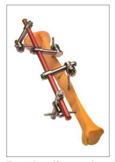
Figure 2. External fixator according to Mitković