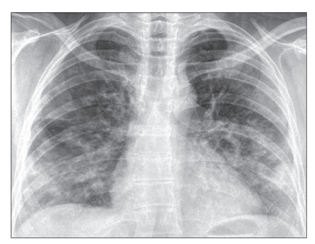
Figure 3. Follow-up chest X-ray now showing the changes initially seen only on the computed tomography scan