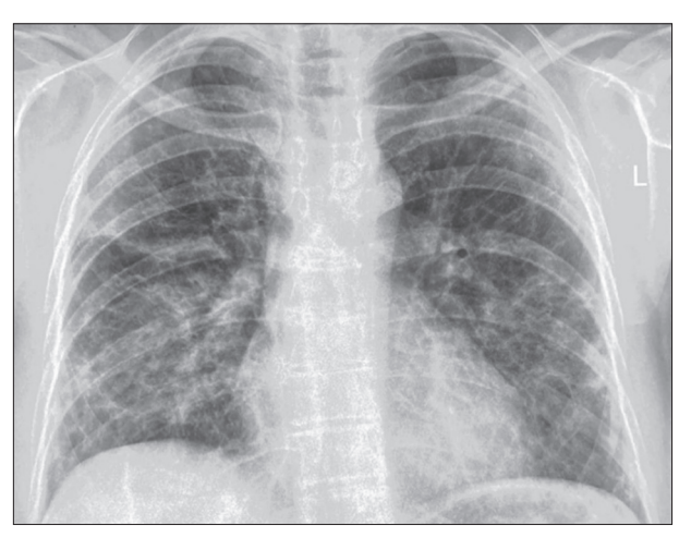
Figure 4. Follow-up chest X-ray after immunosuppressive treatment and high flow oxygenator, showing a certain degree of regression, however areas with fibrosis still remain

the corticosteroid treatment had led to the improvement of the arterial blood gases (pH 7.47, pO _2 9.5 kPa, pCO _2 4.8 kPa, O _2 sat 96%, the results were without O _2 support). With these improvements, the patient was discharged, and continued treatment from home.