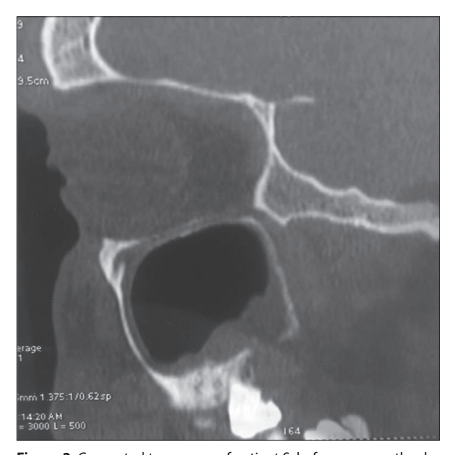
Figure 2. Computed tomogram of patient S; before surgery: the defect of the alveolar process of the right upper jaw, the fistula of the right maxillary sinus with the oral cavity, and thickening of the sinus mucosa are visualised

palpation, and the symptom of fluctuation was positive. When examining the area of a previously removed tooth 1.8, the defect of the alveolar process of the upper jaw was visualized in the retromolar region, with a transition to the vestibular side up to 1.5–1.8 cm. The nasal test was positive. Puncturing the line of mucous membrane closure of the right buccal area, pus was obtained. Abscess of the buccal region on the right and chronic odontogenic sinusitis with oroantral fistula on the right were diagnosed.