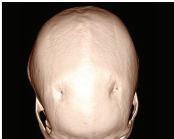
Figure 1. Computed tomography axial bone window displays bone defects of the frontal bones