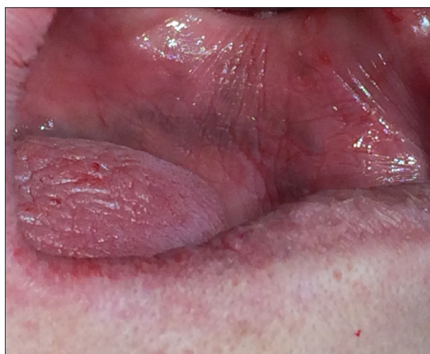
Figure 1. Intraoral manifestations of systemic lupus erythematosus

Extraoral clinical inspection did not demonstrate facial skin involvement. Intraoral clinical examination presented characteristic bilateral discoid and pigmented lesions involving buccal mucosa, reddened tongue with atrophy of the filiform papilla and sore mouth, with no ulcerations observed (Figure 1). The patient complained of symptoms similar to burning mouth syndrome (BMS), especially when consuming acidic or spicy food, difficulties in swallowing, and dry mouth. However, after salivary flow measurement according to the protocol described by Speight et al. [7], the obtained unstimulated saliva flow rate was 0.2 mL/minute. A problem with limited mouth opening was also reported by the patient, as well as the slight pain in the temporomandibular joints (TMJ) while chewing. Clinical examination of the TMJ did not reveal signs of dislocation, subluxation, or crepitation during mandibular movements. Maximal inter-incisal distance was 24 mm. In