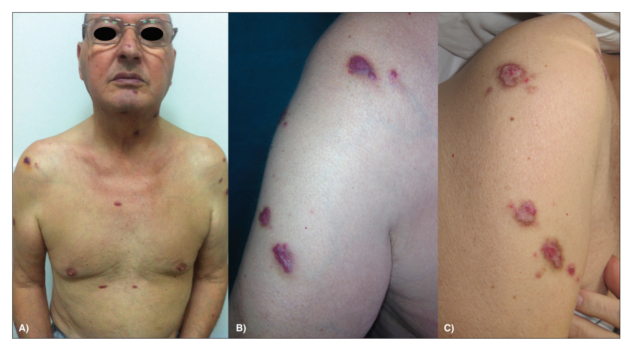
Figure 1. A) Violaceus plaques present on the patient's face, trunk, and extremities; B) close-up of the lesions, infiltrated violaceus plaques with telangiectasia on the periphery of the lesions; C) almost complete resolution of the lesions during the immunosuppression-free period

steroid-sparing agent. Prior to the first skin eruption, the patient had been treated with azathioprine in addition to corticosteroids for one year. At the time of skin lesion eruption, the patient received oral prednisolone (50 mg/day) in addition to azathioprine (2.5 mg/kg/day).