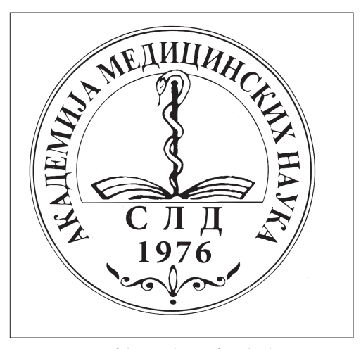
Figure 1. Logo of the Academy of Medical Sciences

Members of the AMS may be regular, associate, honorary, and foreign. Election criteria are similar to those for the Serbian Academy of Sciences and Arts. The overall number of members at present is 298, out of which 132 members are regular, 79 associate, 61 honorary, and 26 foreign, which is around 1% of the total number of SMS members (Figure 2).