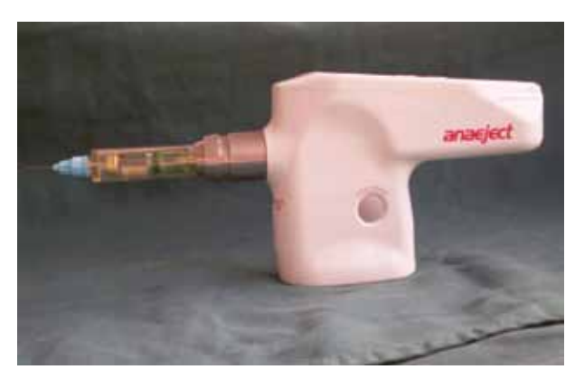
Figure 1. Anaeject computer-controlled local anesthetic delivery system (Septodont, France)

All the patients received the AMSA nerve block as previously described for local anesthesia preceding tooth ex-