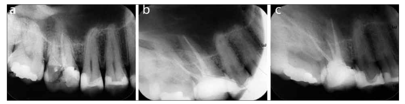
Figure 2. a) Periapical radiography of the left maxillary first molar with inadequate obturation and without changes in the periapical tissue, b) Obturation after retreatment, c) Complete healing after two years.