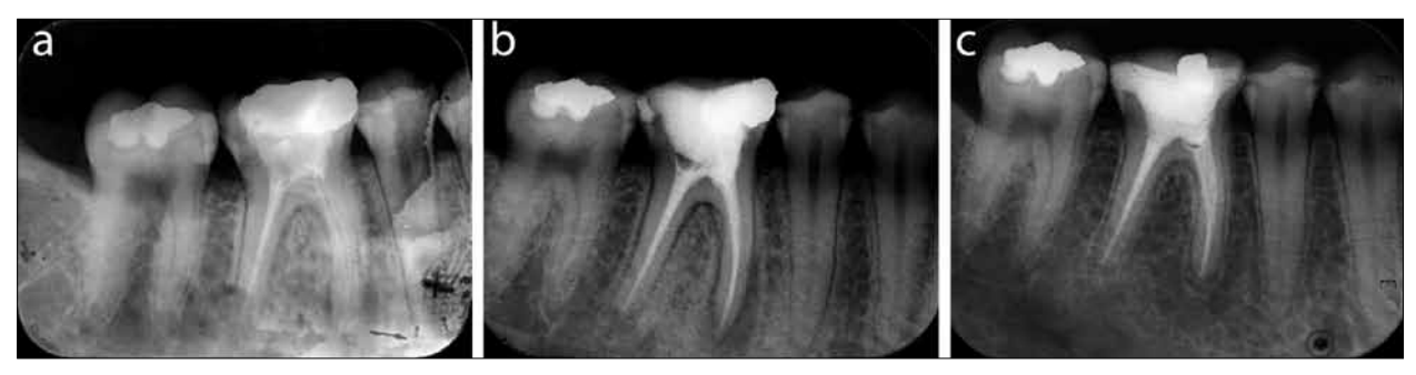
Figure 4. a) Periapical radiography of the left mandibular first molar. No. 36 was painful and swelling was present, b) Obturation after retreatment, c) Complete healing after two years.