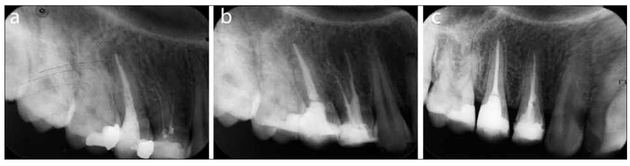
Figure 3. a) Periapical radiography of the left first and second maxillary premolars. No. 24 was sensitive to palpation and with inadequately filled root canals, No. 25 had inhomogeneous filling with periapical radiolucency, b) Obturation after retreatment, c) Complete healing after two years.