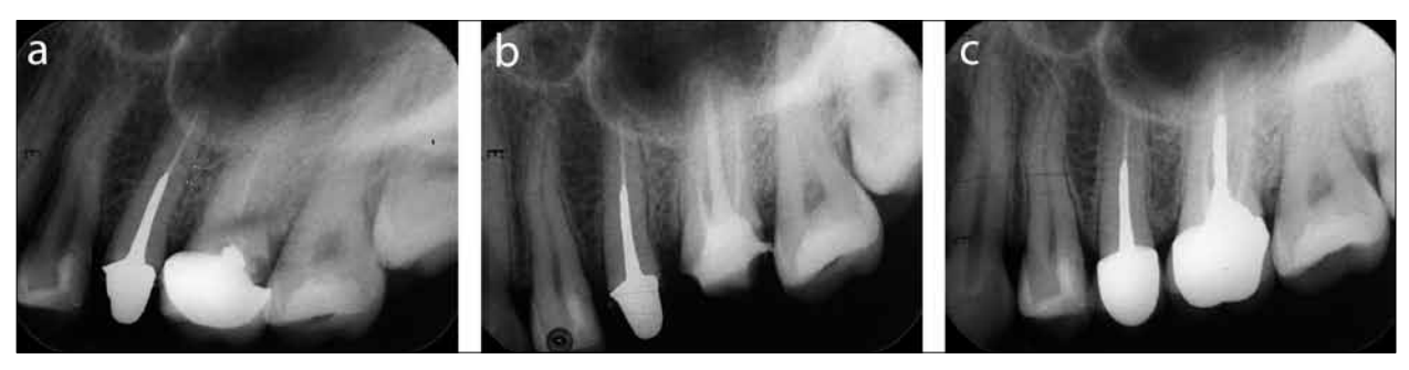
Figure 1. a) Periapical radiography of the right maxillary first molar with forgotten buccal canals, b) Obturation after retreatment, c) Prosthetic reconstruction with post and metal-ceramic crown – complete healing after two years.