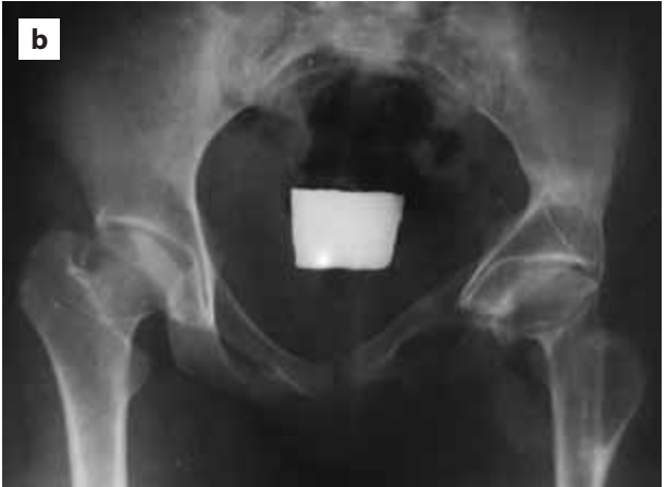
Figure 5. Bilateral postreduction avascular necrosis, left hip treated by triple pelvic osteotomy and greater trochanter descensus (a – preoperative; b – final)