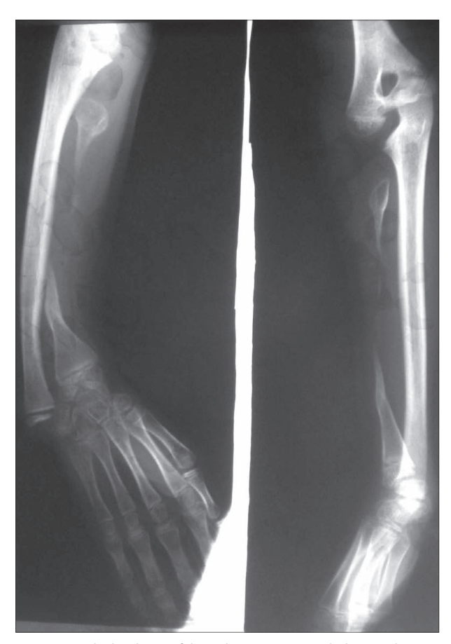
Figure 1. Only distal part of the radius is present with decentralization of the carpus. Note severe protrusion of the ulna. Radiocarpal joint is fixed in dorsiflexion.

ulnar diaphysis was joined to the distal radial metaphysis using the plate with a screw. The distal part of the ulna was retained. In the same procedure, the centralization of the carpus over the radius was achieved (Figure 3). Operation was performed by dorsal approach allowing for exposure of extensor tendons, which were affected by osteomyelitis that caused them to become shortened, fused to each other, and fibrotic as well as excursion of tendons that was insufficient, which we considered inappropriate for elongation. Bone union was achieved and the plate was removed only 8 months after osteosynthesis. In the same procedures, the transfer of the brachioradialis to the extensor pollicis longus was performed for making the extension of the thumb possible (Figure 4). The patient was referred to physical therapy. On the control 8 moths after third surgery, the motion of the wrist was still limited with the wrist in dorsiflexion and limited flexion in MCP joints. The patient had moderate pain in her wrist only during intensive work therapy. To get a better motion of her wrist and eliminate the pain, proximal row carpectomy was performed followed by fixation of the wrist with 2 K-wire during three weeks (Figure 5).