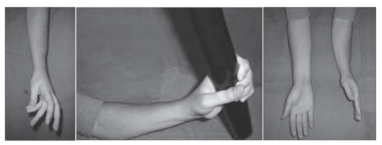
Figure 6. Full dorsiflexion in the wrist is possible but 20 degree limitation of palmar flexion still persists. The patient is able to make complete fist and grip, which is quite satisfactory. Function of the hand is good, and opposition of the thumb to all fingers is possible.

One-bone forearm is a method of choice for managing the radial clubhand deformity in which case the distal metaphysis of the radius and proximal ulna are preserved. To achieve the best functional results, we recommend step by step operative protocol instead of one single procedure; elongation before one bone procedure and also, if necessary, other operations; proximal row carpectomy and tendon transfers.