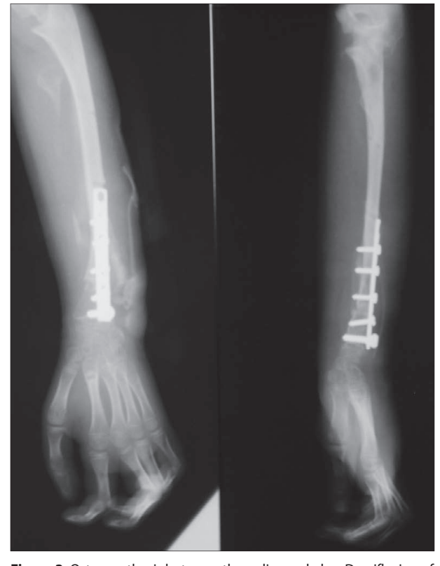
Figure 3. Osteosynthesis between the radius and ulna. Dorsiflexion of the wrist and extension of the MCP and flexion of PIP and DIP joints due to short extensors.