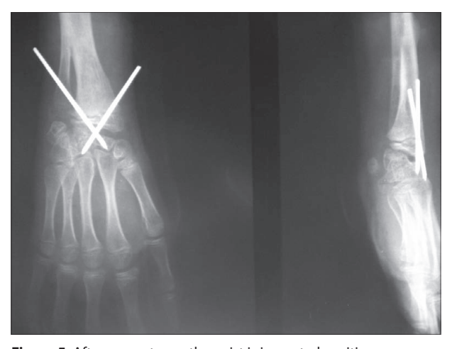
\textbf{Figure 5.} \ \textbf{After carpectomy; the wrist is in neutral position}