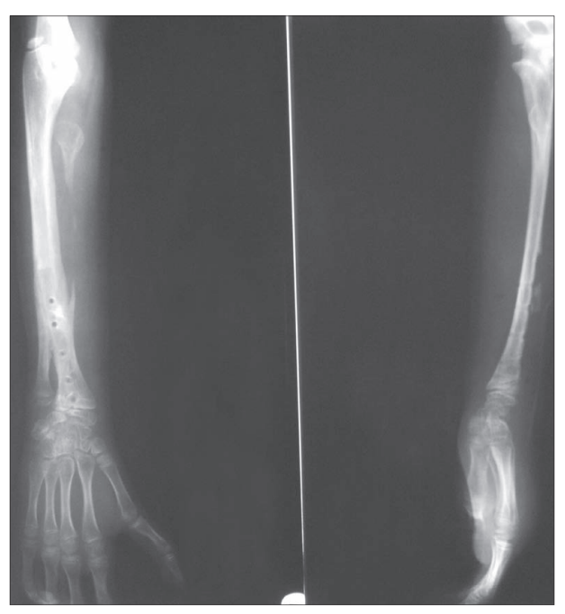
Figure 4. Good bone healing. Note extension of the thumb. The remaining distal part of the ulna contributed to bone healing between the ulna and radius, making the synostosis which additionally stabilized the wrist. Note centralization of the carpus and good relationship between the ulna and radius in the wrist.