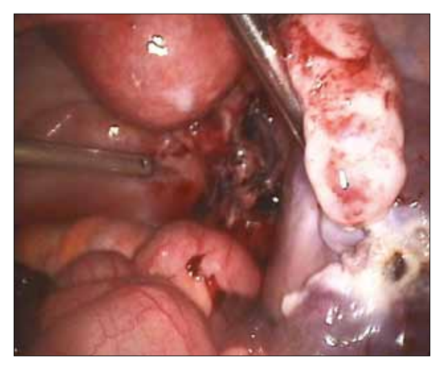
Figure 2. Ectopic pregnancy adjacent to appendix

Histological examination showed a small decidual area in the right tube with trophoblastic activity and chorionic villi on the side of the appendix and an adhesion between the appendix and the right tube (Figures 3 and 4). Two