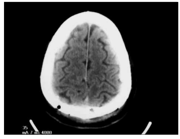
Figure 3. Postoperative CT of the brain. No residual tumor was found.

part of polysystemic enchondromatosis (Ollier's disease) or multiple enchondromatosis associated with soft tissue angiomas (Maffucci syndrome) [20]. The first case of intracranial chondroma was reported in 1851 by Hirschfield [2] and the first surgical resection was reported in 1982 by Nixon [3]. Since then 127 cases of intracranial chondromas were reported occurring at the base of the scull and originating from spheno-petrosal, spheno-occipital and