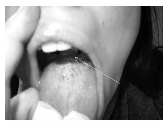
Figure 1. Rosy change of smooth surface with visible blood vessels. With the help of endoscope for indirect laryngoscopy it is not possible to present ectopic thyroid gland completely. A smooth rosy change is observed which completely fills the visual field of endoscope along with traces of blood vessels.