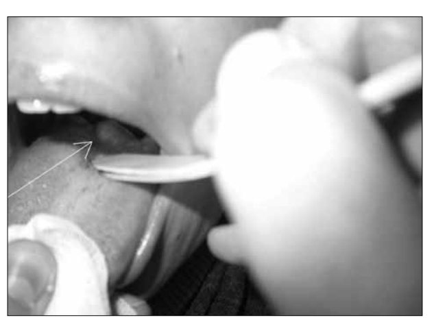
Figure 2. By the maneuver of tongue traction and pressure to the median and last third of the tongue, ectopic thyroid gland is completely presented. It is localized in the middle line and stretches to the left side. Its dimension is 2×2.5 cm; it is of rosy color, smooth surface, clearly demarcated from the surrounding tonsillar tissue of lingual tonsils.

The endocrinologist that was consulted at the time suggested scintigraphy of the thyroid gland and evaluation of its function. Thyroid gland scintigraphy by the application of <sup>131</sup>I showed an oval area of intensive accumulation of radiopharmaceutic in the zone of the medial face line, around the tongue base. In the area of the anatomical localization of the thyroid gland there was a lack of functional tissue, thus we confirmed the diagnosis of ectopic localization of the thyroid gland (Figure 4). Testing of the thyroid gland function verified increased TSH (thyroid-stimulating hormone) level (11.02 mIU/l (normal range 0.35-4.94)) and normal concentration of T3 (triiodthy-